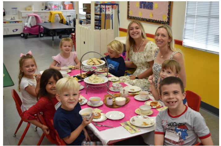
The Orchard, preschool Sunday School, had a tea party to celebrate our rising kindergartners.