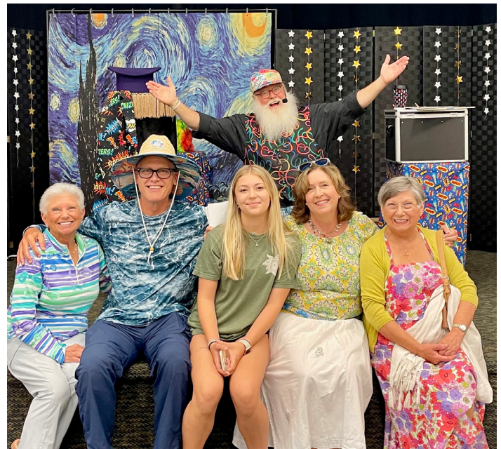
What a beautiful day at this year’s Easter Eggstravaganza! The weather was perfect as families from our church and neighborhood came to have fun searching for eggs, petting animals, eating barbecue