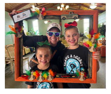
Fall Halloween Party and Costume Contest