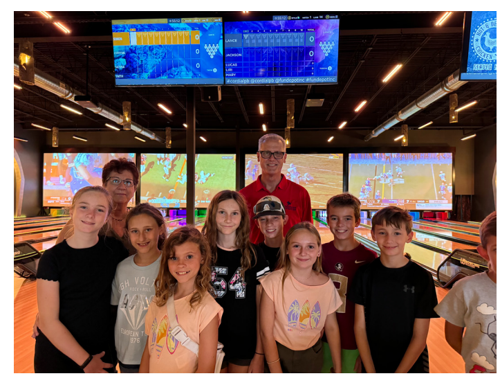
Club 45 Family Road Rally